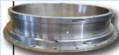
Shaft Sleeves For hydro turbines