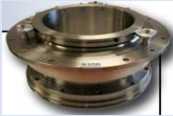
Cartridge seals For turbine shafts up to 15 inch