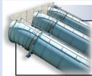
Penstock / Spiral Case seals