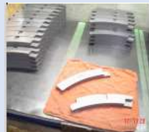
Replacement carbons for any type of seal