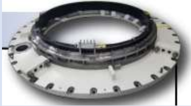
Axial seals Turbine pressure up to 200 PSI (1380 kPa)